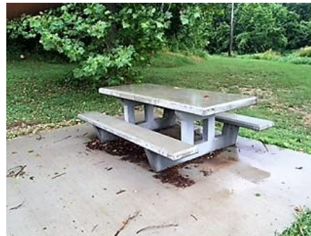
Tables from Rite-Way Concrete Products

changes. We still need volunteers to just show up, hope you can make it.