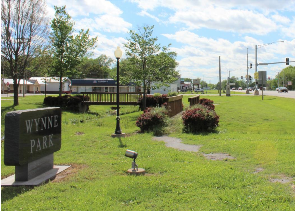
CLEAN UP PLANNED FOR WYNNE PARK, JULY 14 TH FROM 7 AM TO 11 AM, JOIN US